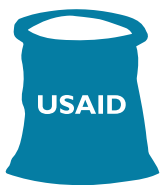
U.S. grown food

In order to make biggest impact possible, we must provide the right kind of food aid to those in need, including