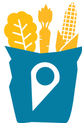
Locally grown food